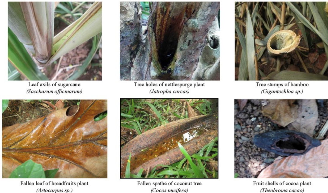
Figure 1. Samples of plant parts that impound water serve as phytotelmata found in Lampung

The data in Table 2 can be elaborated as follows. There are two species of Aedes mosquito larvae managed to be identified in this study, i.e. Ae. albopictus and Ae. crysolineatus . The larvae can be found in the phytotelmata with a volume as low as of 8.5 ml, i.e. in the leaf axils of pineapple ( Ananas comosus ) and banana ( Musa paradisiaca ). In average, a single larvae of Ae. albopictus can even live in the water column with a volume of only 0.31 ml, such as in the hole of bamboo stumps where 125 larvae inhabit water column with a volume of 38.8 ml. Phytotelmic water temperature that can be occupied by Aedes larvae is ranged from 24 to 29°C, but seemingly the most preferred temperature is 24-26°C (Fig. 2). Phytotelmic water pH range where Aedes larvae are found is 5.5 - 9, with the most preferred pH by both species is 6 (Fig. 3).