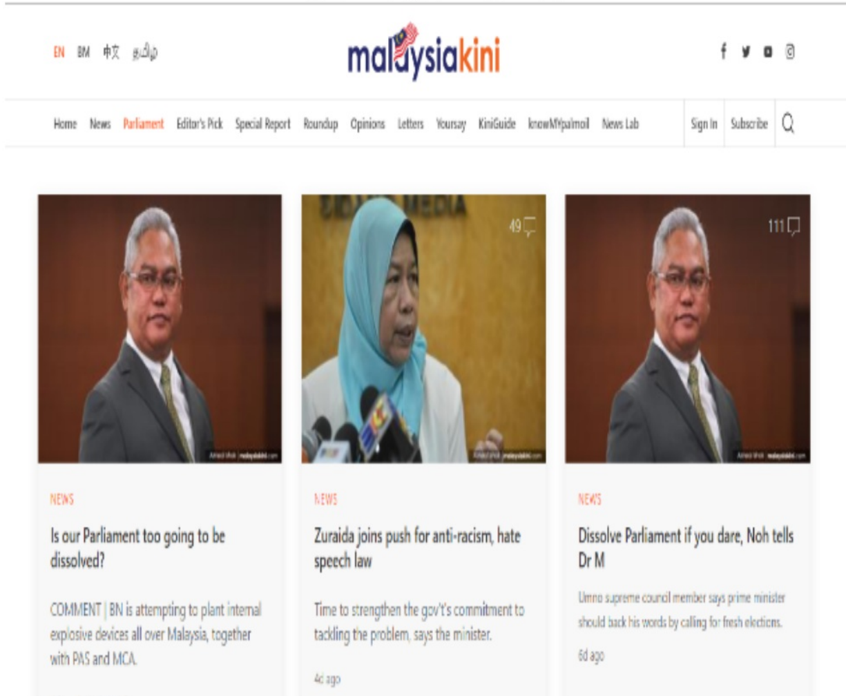
Figure 2. Malaysiakini.com Portal

as The Star whereas in the middle of May 2009 this media page was only ranked 4th and was less popular than Utusan Malaysia and Berita Harian (Ishak, 2009).