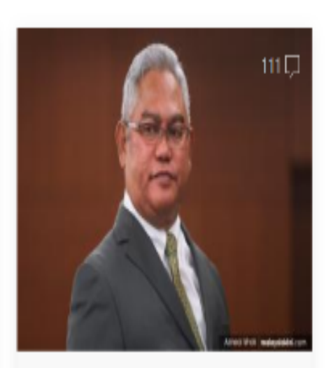
Dissolve Parliament if you dare, Noh tells Dr M