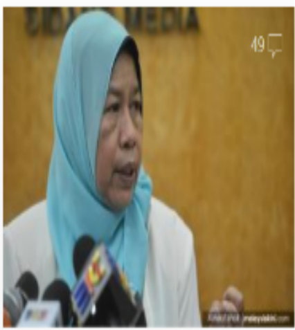
Zuraida joins push for anti-racism, hate speech law

COMMENT | BN is attempting to plant internal explosive devices all over Malaysia, together with PAS and MCA.