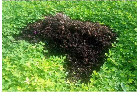
Figure 4. Investigated samples: fruit waste biomass.

Collected CP samples were removed from the raw coffee cherries by using of pulping machine (see figure. 5) directly after harvest and CH samples were collected after the process of green coffee beans natural sun drying (see figure. 6) and removing of skin remains. Thus, CP samples occurred in their initial moisture content, while CH samples were already sundried during drying process.