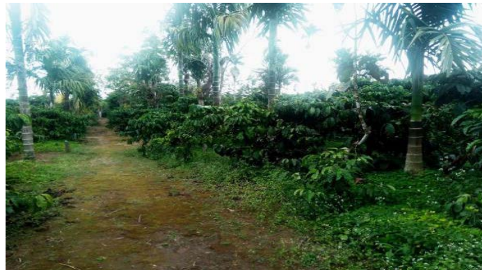
Figure 7. Intercropping principle at target plantation.

Target plantations were cultivated by using of the intercropping principle; an Areca palm ( Areca catechu L.) specie was grown there as an intercrop intended to protect coffee trees against to abundance of sunshine and prevent of the water vaporization [32], see figure 7.