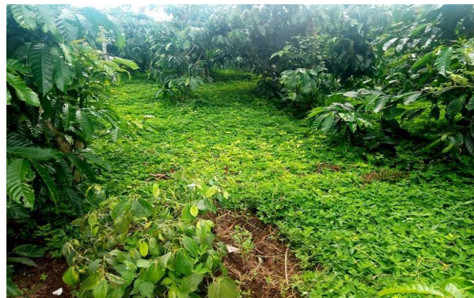
Figure 8. Cover crops principle at target plantation.