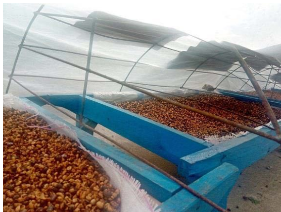
Figure 6. Postharvest treatment equipment: solar sun dryer.