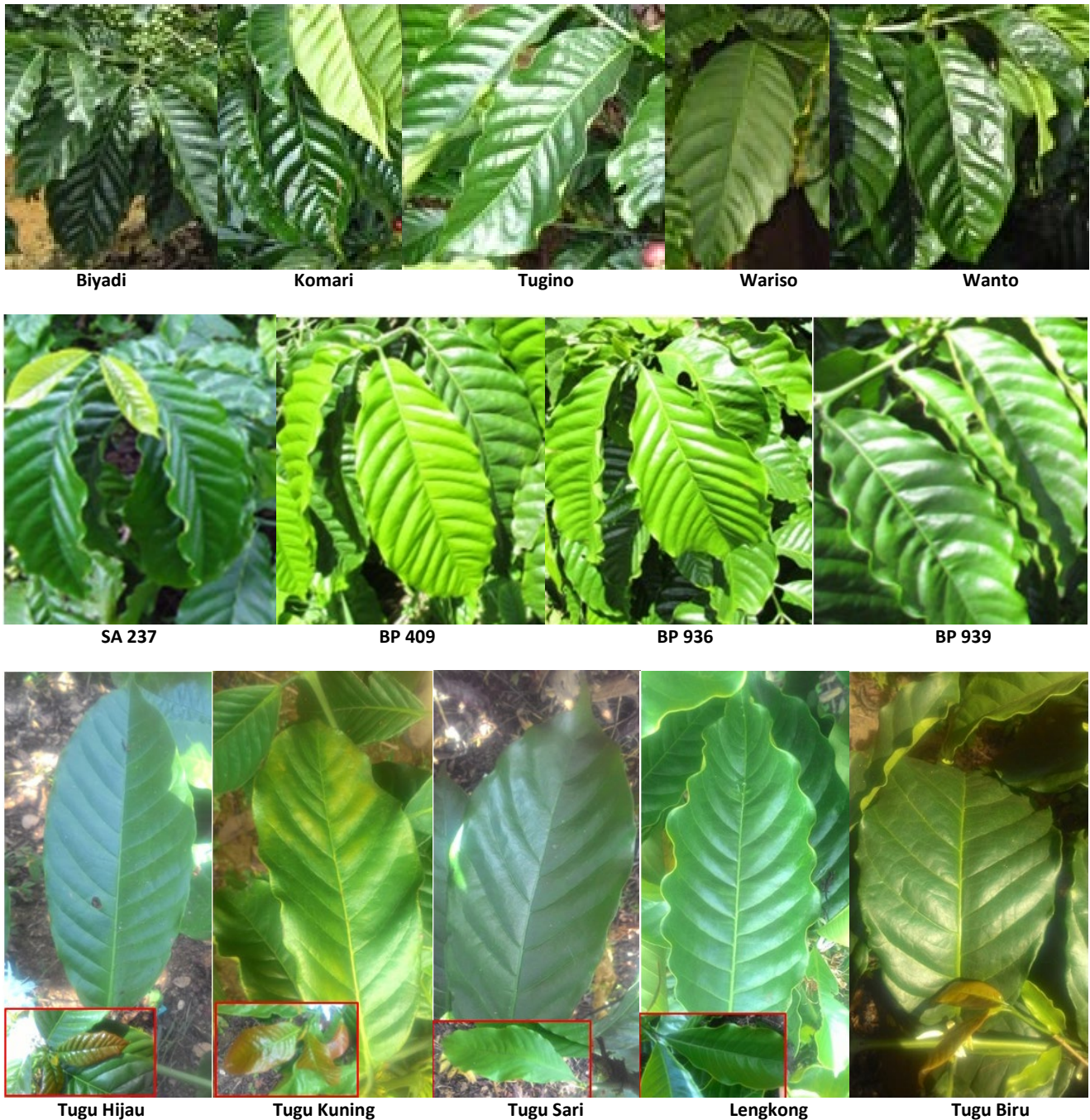
Figure 2. Leaf diversity among robusta coffee clones in Lampung Province, Indonesia

Overall, there were significant differences in terms of leaf characters between the coffee clones. The length of leaf ranged from 25.20 cm to 16.86 cm among the clones. Tugu Sari had the highest value (25.20 cm) for leaf length but the value was not significantly different from that of BP936 (24.11 cm), Tugu Hijau (23.90 cm) and SA 237 (23.33 cm). In contrast, Komari and Wariso had the shortest leaf length with 16.86 cm and 18.17 cm, respectively. Based on the data in Table 2, it can be seen that the leaf length of coffee clones from West Lampung District, namely Tugu Sari, Tugu Hijau and Tugu Kuning, were comparable to that of the Jember clones (SA 237, BP