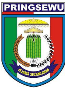
Figure 2 The Logo and Slogan of Pringsewu

Landmark was designed as statements of the city branding in architectural to generate enormous public interest. The building have become brands in their own right and being a communication media to provides the city vision and development strategies. Landmark is used to reflect the consistency of the visual appearance for the government to strengthen the city branding. There are monument signs in Pringsewu describe a symbols of bamboo philosophy despite it wasnot made of the real bamboo material (Figure 3). Based on concepts and design, it was unfunctional building and lacking to being a succesfull attributes to provides “bamboo city” brand. Nothing building construction and designed provides bamboo as a building material. Bamboo as a building material has high compressive strength, low weight, renewable, extremely versatile and sustain in those locations where it is found in abundance. Bamboo material is used for the construction such scaffolding, structures, householding even high level buiding. It is one of the fastest growing plants than most other species of plants, which is conventionally suitable cultivated in Southeast Asia. Generally the landmark for “bamboo city” brand was lacking in innovative branding features.