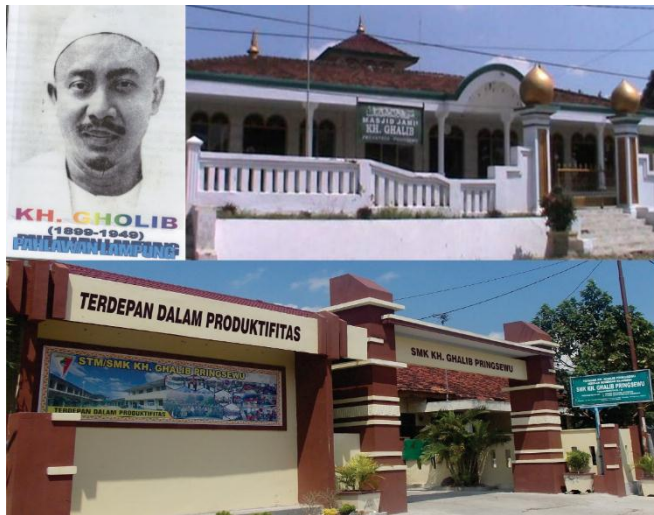
Figure 1 K.H Ghalib Jami Mosque and Pesantren in Pringsewu

development by K.H.Gholib in 18th centuries. He was islamic preacher who came from East Java into Sumatera and Johor, Malaysia. He well known as “ kyai bambu seribu ”, a religious leader with respecting, tolerance and anti-discrimination in multiracial and multireligious society during Dutch kolonial. In 1927, he built Jami mosque and pesantrena (a place where students live and study Islamic knowledges) to develop islamic education in Pringsewu (Figure 1). It was a historical building in Pringsewu and K.H. Ghalid become street’s name.