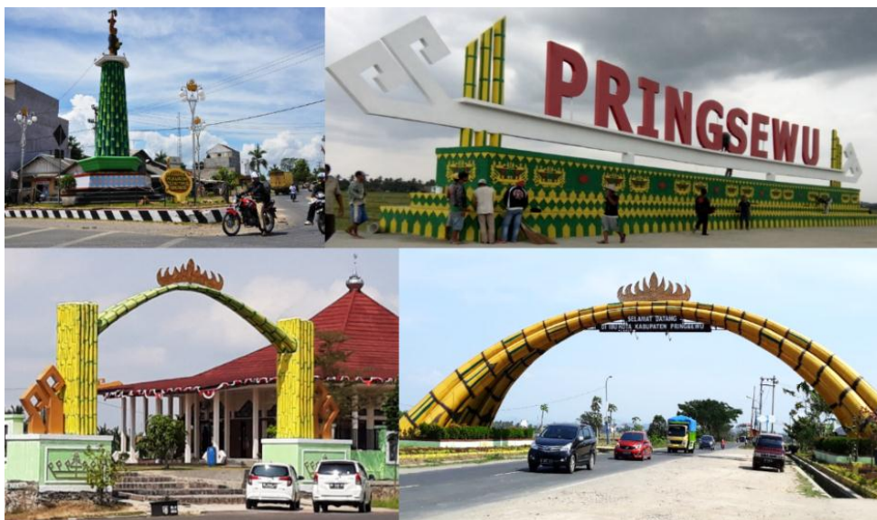
Figure 3 The Monument Signs in Pringsewu

Landmark was designed as statements of the city branding in architectural to generate enormous public interest. The building have become brands in their own right and being a communication media to provides the city vision and development strategies. Landmark is used to reflect the consistency of the visual appearance for the government to strengthen the city branding. There are monument signs in Pringsewu describe a symbols of bamboo philosophy despite it wasnot made of the real bamboo material (Figure 3). Based on concepts and design, it was unfunctional building and lacking to being a succesfull attributes to provides “bamboo city” brand. Nothing building construction and designed provides bamboo as a building material. Bamboo as a building material has high compressive strength, low weight, renewable, extremely versatile and sustain in those locations where it is found in abundance. Bamboo material is used for the construction such scaffolding, structures, householding even high level buiding. It is one of the fastest growing plants than most other species of plants, which is conventionally suitable cultivated in Southeast Asia. Generally the landmark for “bamboo city” brand was lacking in innovative branding features.