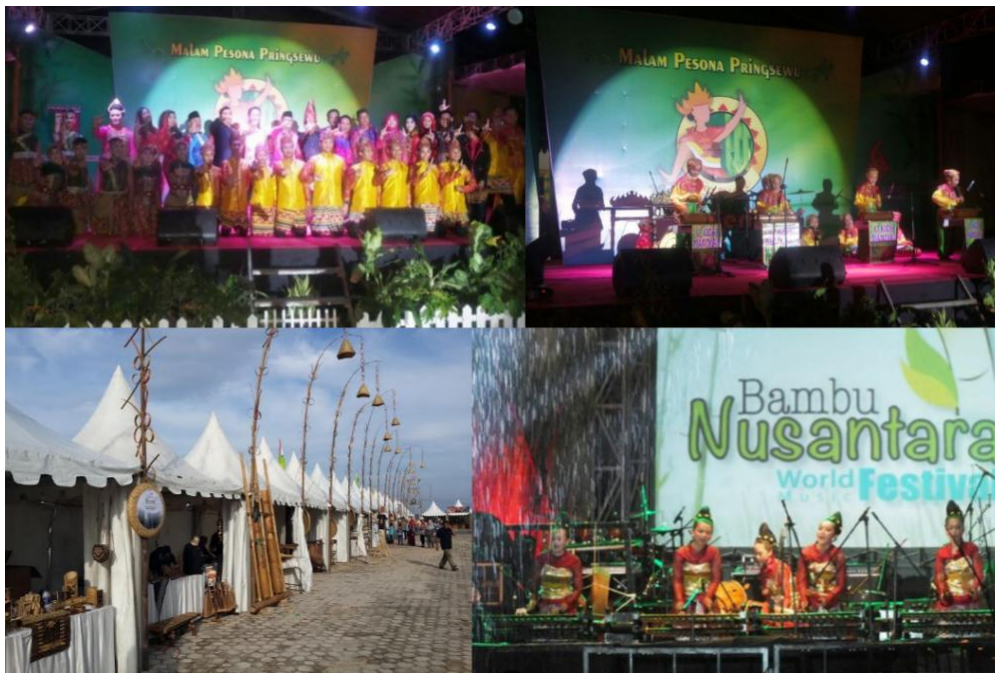
Figure 4 Cultural Events in Pringsewu

Supporting cultural industries in Lampung Province, Pringsewu is chosen being host for the 8th and 9th Bambu Nusantara Festivals which is annual international events of Economic Creative and Tourism Ministry (Figure 4). It was held from May 15th to 16th 2014 and then in November 29th - 30 th 2015 at Pringsewu Government Field. Events is opened to all various of performance including folk dance, folk music, traditional dance group, modern dance and traditional icon culinary. This festival features various product and attractions to develop and highlight bamboo as local potentials of Pringsewu identity. The cultural festivals attract culture tourist to local community events, it have contributed in the development of cultural tourism. Festivals have major impacts to promote the local potentials and the host communities. The local government as well private sectors and society in general have responsibility for tourism development and promotion to global market.