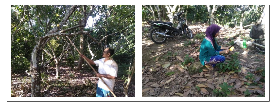
Figure 2 Men and women collaborating in cocoa harvesting

Almost all respondent households allowed women to carry out harvesting activities. Based on the result of interviews, harvesting were classified for mild activities, therefore women were being involved in processes. According to [10], women were only involved in light activities such as collecting ginger, peanut, cocoa, and clove yields. However, considered for being more diligent than men, women were in full charge on chili harvesting. Harvesting activities carried out by men assisted by women are presented in Figure 2.