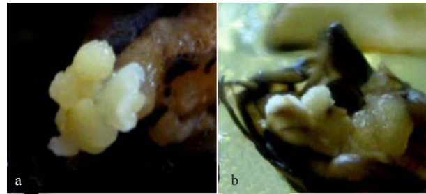
Figure 1. Callus formed on immature leaf segments in tissue culture of oil palm. a and b were callus formed on leaf explants treated with MS medium without activated charcoal containing 10 and 15 \mu\text{M} 2,4-D, respectively.

No activated charcoal was added in media.