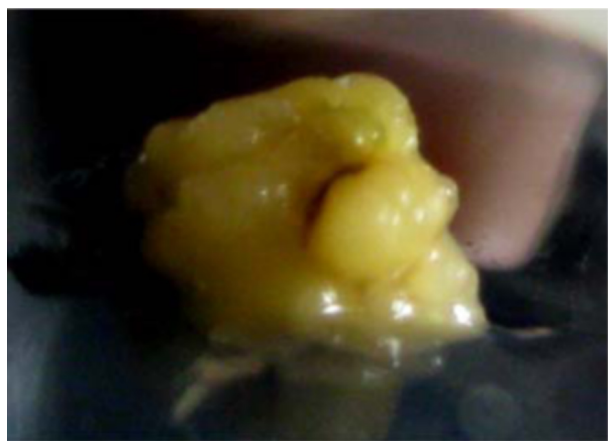
Figure 3. Clumps of callus on embryogenic callus induction medium (ECIM).