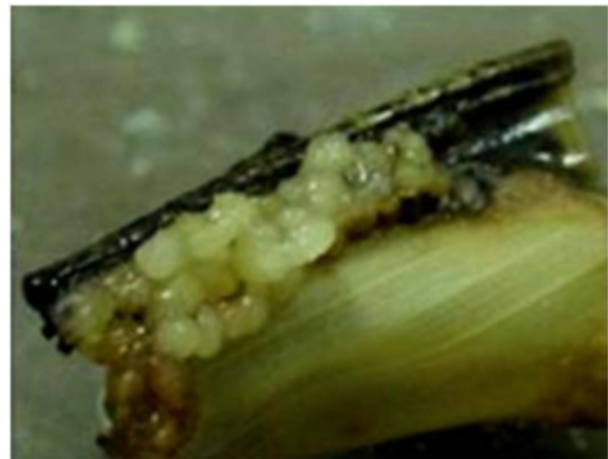
Figure 2. Callus formed on immature leaf segments in MS medium containing 2,4-D 450 \mu\text{M} and 2 g/l activated charcoal.