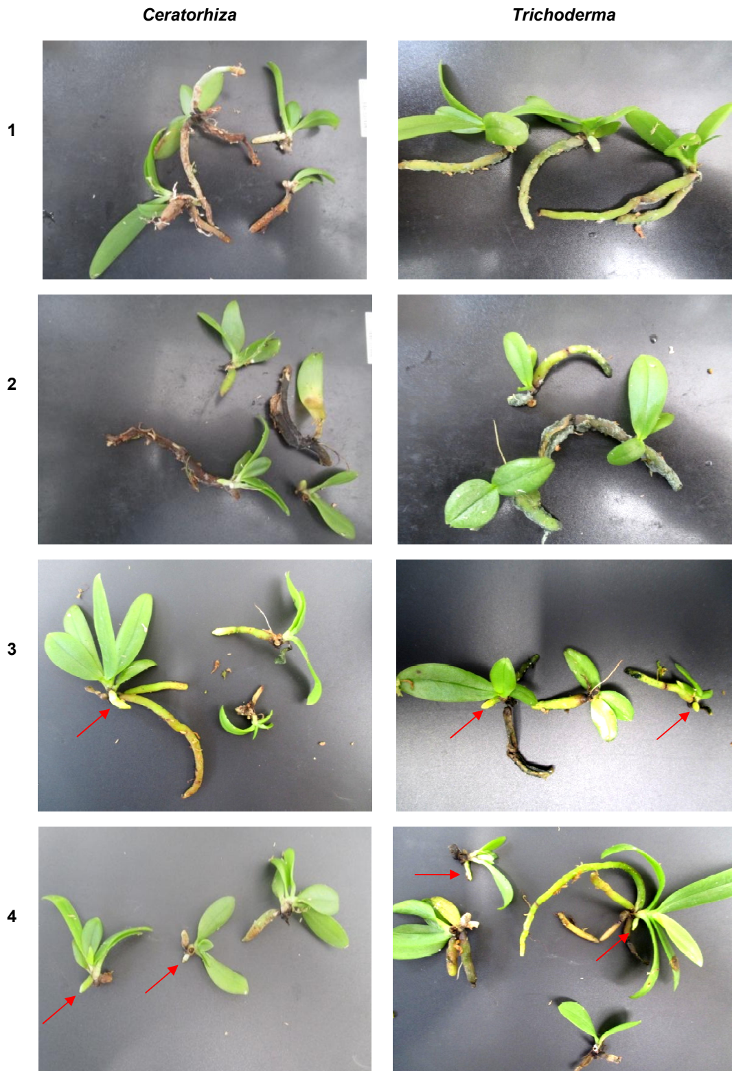
Fig. 2. Development of plantlet results from mycorrhizal inoculation per week; (1) week 1; (2) week 2; (3) week 3; (4) week 4. The arrows indicate the emergence of new roots