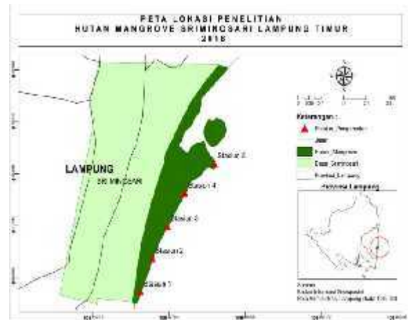
Figure 1. Research Location

The research was done in the area of mangrove forests in the village of Sriminosari sub-district of Labuhan Maringgai East Lampung district that is currently being developed as an ecotourism district. The research was carried out in November-January 2019.