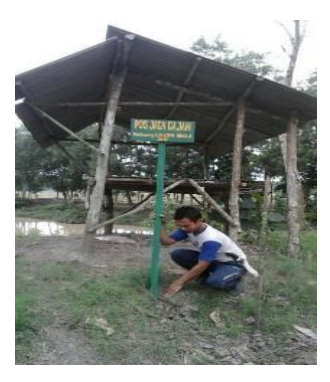
Figure 10. name board in potential ecotourism points Margahayu Resort and direction to Rumah Konservasi Margahayu, Labuhan Ratu VII