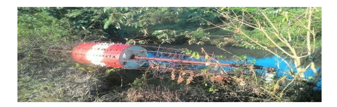
Figure 4. Spiny drum, deterrence tool in wild elephant active entrance track to Margahayu, Labuhan Ratu VII