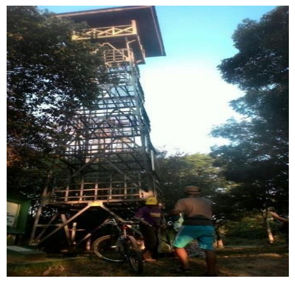
Figure 5. watch tower in Margahayu Resort