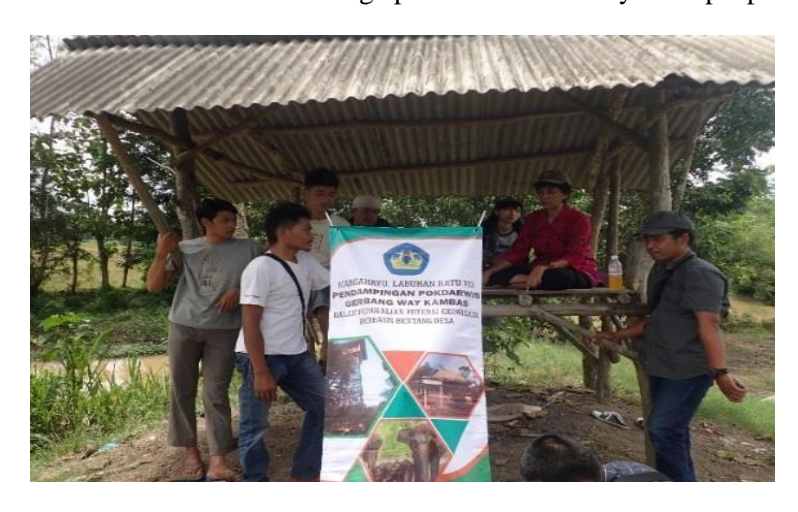
Figure 9. Margahayu Resort post, Labuhan Ratu VII

Jungle track survey was done along the border lane of Margahayu – WKNP. The track choice was expected to fulfill local people wish as well as its safety. This tracks also represented the unique landscape of Margahayu. Potential point tagging and direction was using the name board (Figure 10).