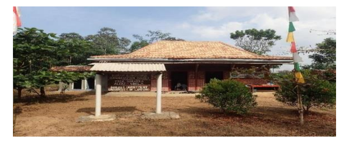
Figure 2. . Conservation house as Biology Department Universitas Lampung, Margahayu, Labuhan Ratu VII