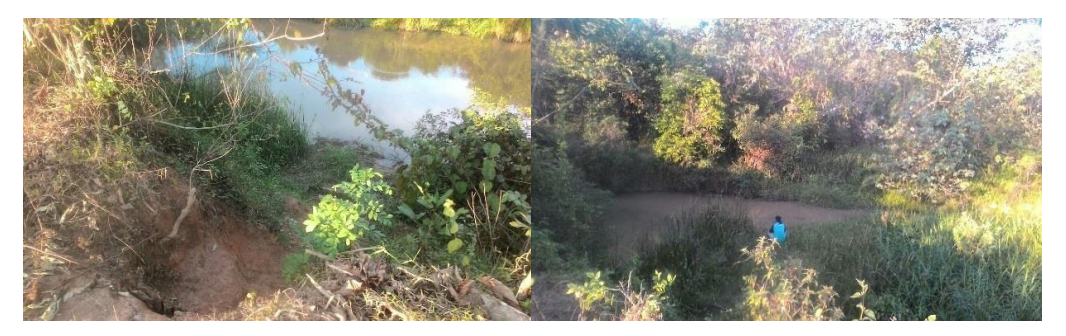
Figure 3. Active wild sumatran elephant tracks and entrance point to Margahayu, Labuhan Ratu VII, East Lampung and for local fishing activities.