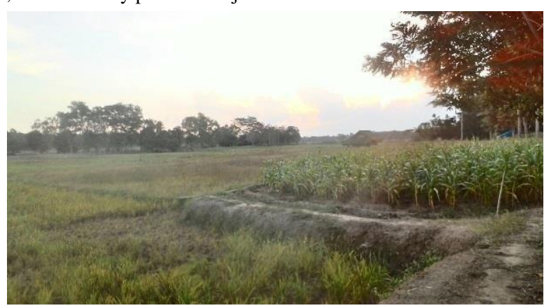
Figure 7. The beauty and uniqueness of Margahayu landscape directly next to WKNP

5. Margahayu landscape (Figure 7) next to WKNP, is a potential and interesting view for jungle track activity, and so far has been done. With sharpening the knowledge on wildlife diversity for both flora and fauna, and the back ground related to its existence in WKNP, it will be very potential object for education tourism.