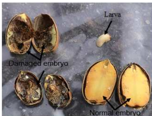
Figure 1. Photographic images of normal and damaged acorn embryo (cotyledons) and parasitic larva.