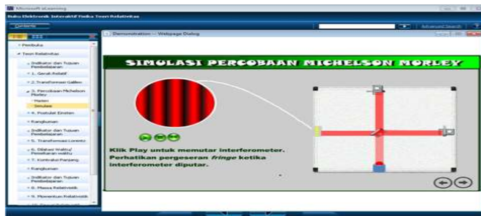
FIGURE 2. E-Book Page Example of Michelson-Morley Experimental Simulation

improving the test scores, improve the students' attitudes, improve the readiness for direct practice, and strengthen the conceptual knowledge [23]. For further understanding, it was provided an interactive exercise such as changes in particle size when the particle moves closer to the speed of light.