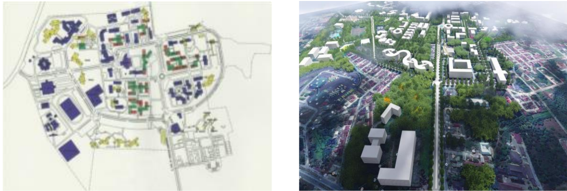
Figure 1. Map and Aerial View of the University of Lampung Campus Spatial Planning [1]

must be developed as a network system that integrate with each other, with the campus spatial planning, and with the city's network systems. The university also established a policy to maintain 60% of campus area as open spaces that consist of: green and blue (pools) spaces, sports fields and outdoor theater plazas. The following figures are campus map and aerial view: