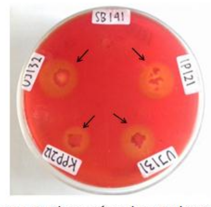
Figure 2. Signs ✓ produce xylananase enzymes