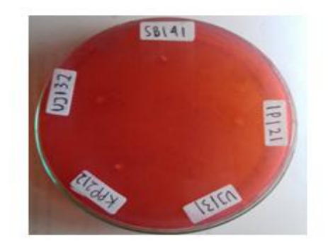
Figure 5. No isolated produced mannanase enzyme.

Figure 4. No isolates produced amilase enzyme