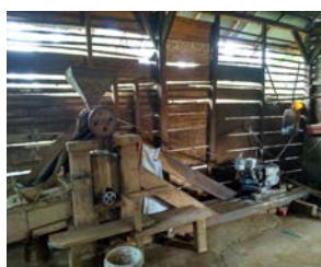
Fig. 1. Coffee grinder machine