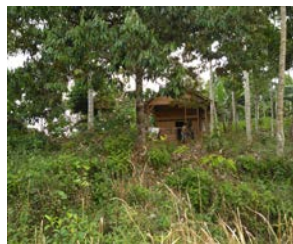
Fig. 2. Temporary place of the local community